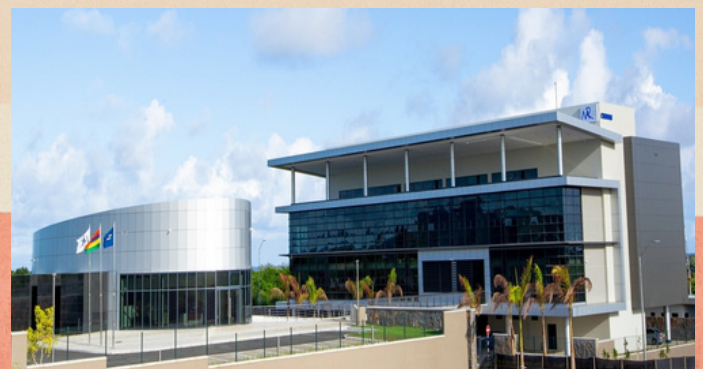
The ICCC complex at Plaine Magnien with the conference centre on the left and administrative/operational block on the right

Technology is also enhancing MRA Customs' connectivity through "single window" platforms where many government agencies work in a collaborative and coordinated manner. Moreover, over time, MRA Customs' Electronic Data Interchange tools and systems have been enhanced with improved core functionalities aiming to increase the efficiency and effectiveness in the processing of customs declarations. MRA Customs is also harnessing on emerging technologies and techniques such as Artificial Intelligence, block chain technology, and big data analytics to enhance risk management and fraud detection capabilities. The digital transformation of MRA Customs is impressive and has been very beneficial to the trading community and the public at large.