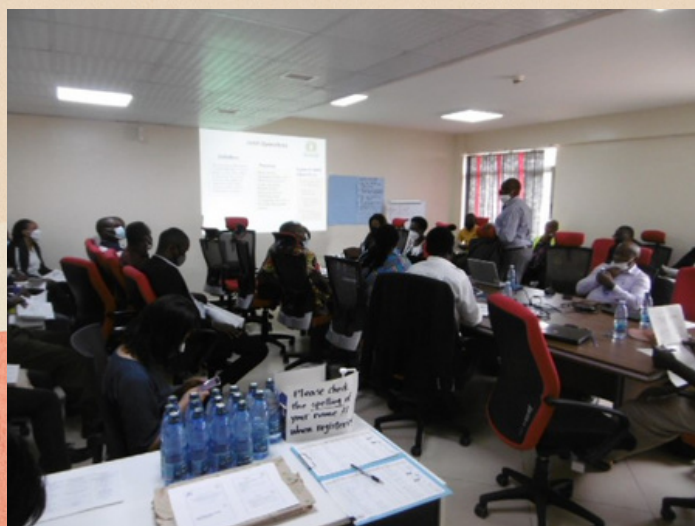
OSBP Training at Namanga, February 2022