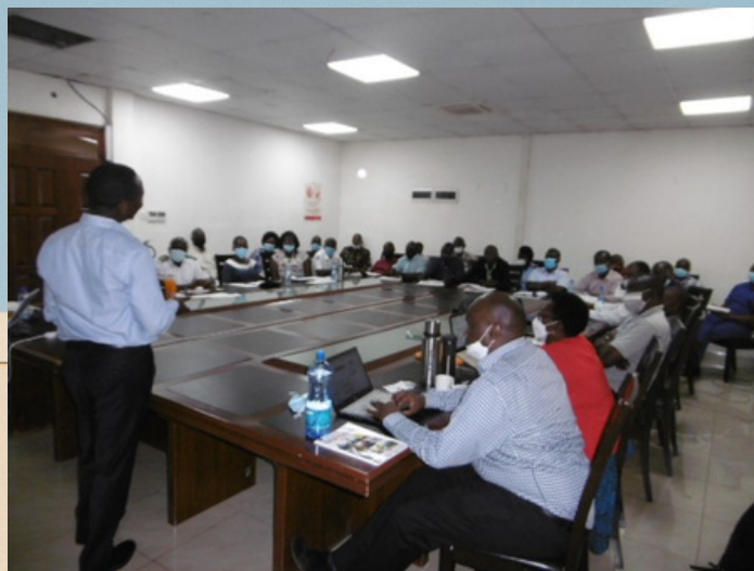
OSBP Training at Malaba, January 2022

In addition, on 31 January 2022, the project supported a joint border committee meeting at Malaba. The meeting updated the performance monitoring report for the OSBP, considered measures to better apply the EAC OSBP Procedures at Namanga, and discussed the results of and lessons learned from a time measurement survey conducted by the project at Namanga in November 2021. OSBPs provide for more efficient border crossing by persons and goods, with resulting economic and social benefits.