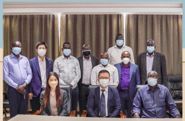
A group photo of JCC members in Juba