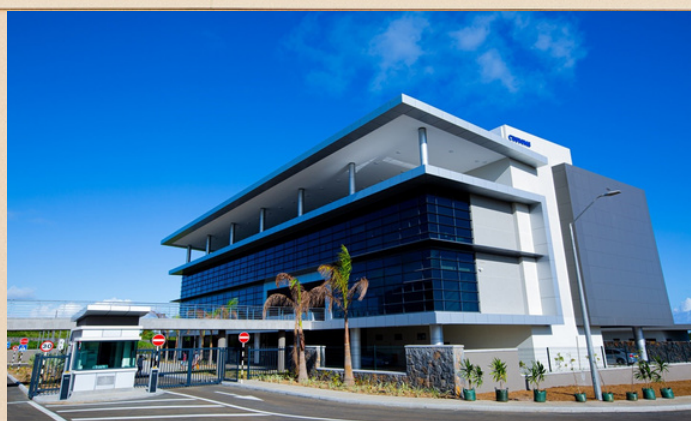
Administrative block and operational area of the ICCC that houses Customs and other government agencies under a single roof