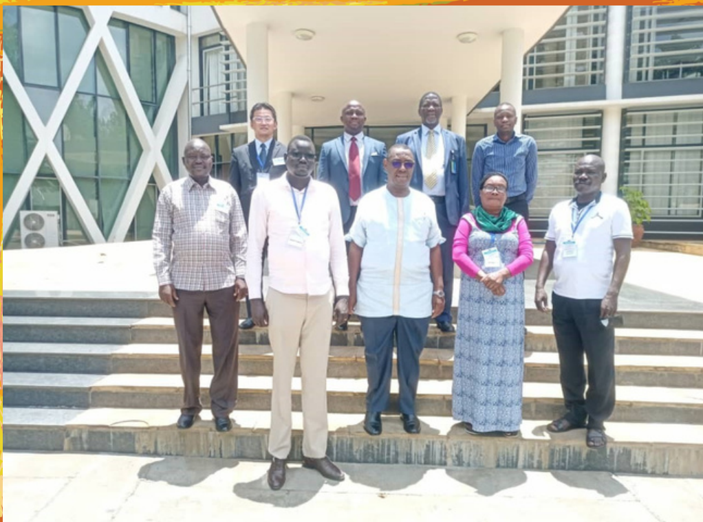
A group photo of project members with a team from the EAC Secretariat

Regarding the EAC-ROO, a competent Authority in South Sudan should be determined as soon as possible to carry out the necessary work (human resource development and updates of laws and regulations) to issue certificates of origin. Additionally, the project recommends aligning all Financial Act tax rates with EAC-CET, reviewing the South Sudan Tariff, and supporting the coordination of a competent ROO Authority in South Sudan.