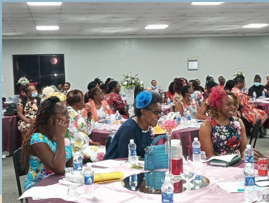
ZIMRA ladies follow proceedings during WiT launch

The Zimbabwe Revenue Authority (ZIMRA) launched Women in Taxation (WiT) Forum at a colourful event on 18 March 2022 in Mutare City. The launch was intentionally held during the Women's Month as part of the global initiatives and activities to celebrate women.