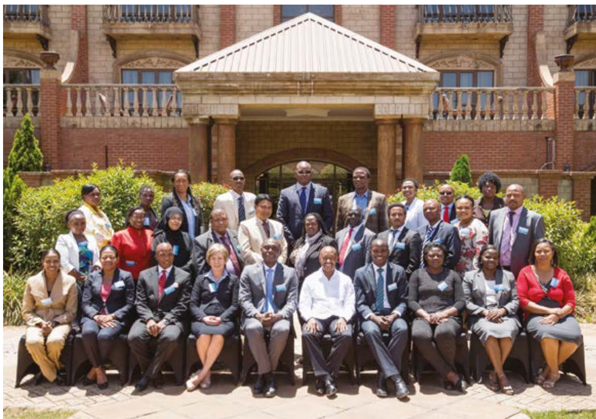
RSG meeting held in South Africa November, 2015