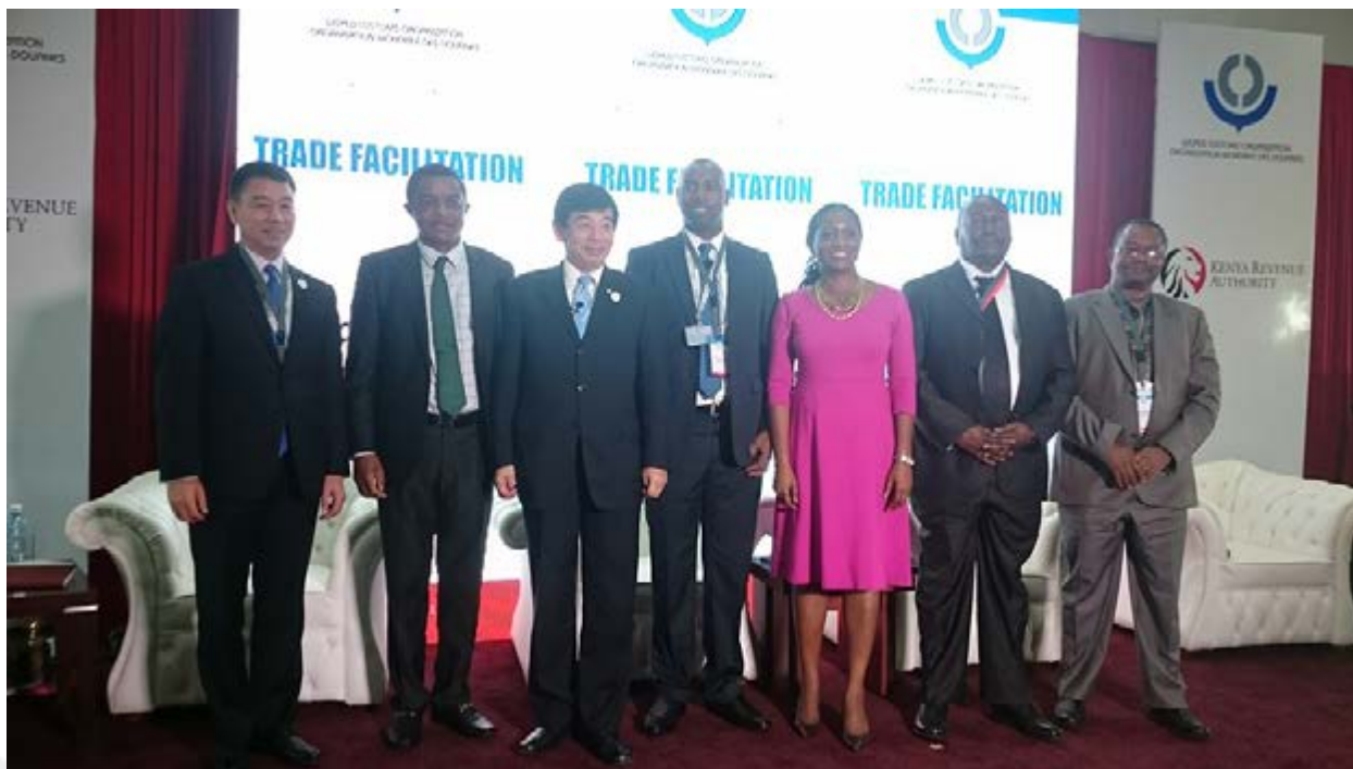
Panelists during the WTO MC side meeting in Nairobi.