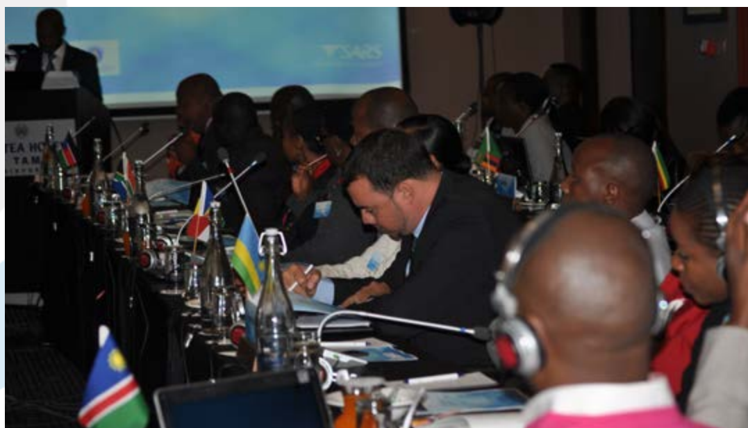
A section of the participants who participated at the workshop.