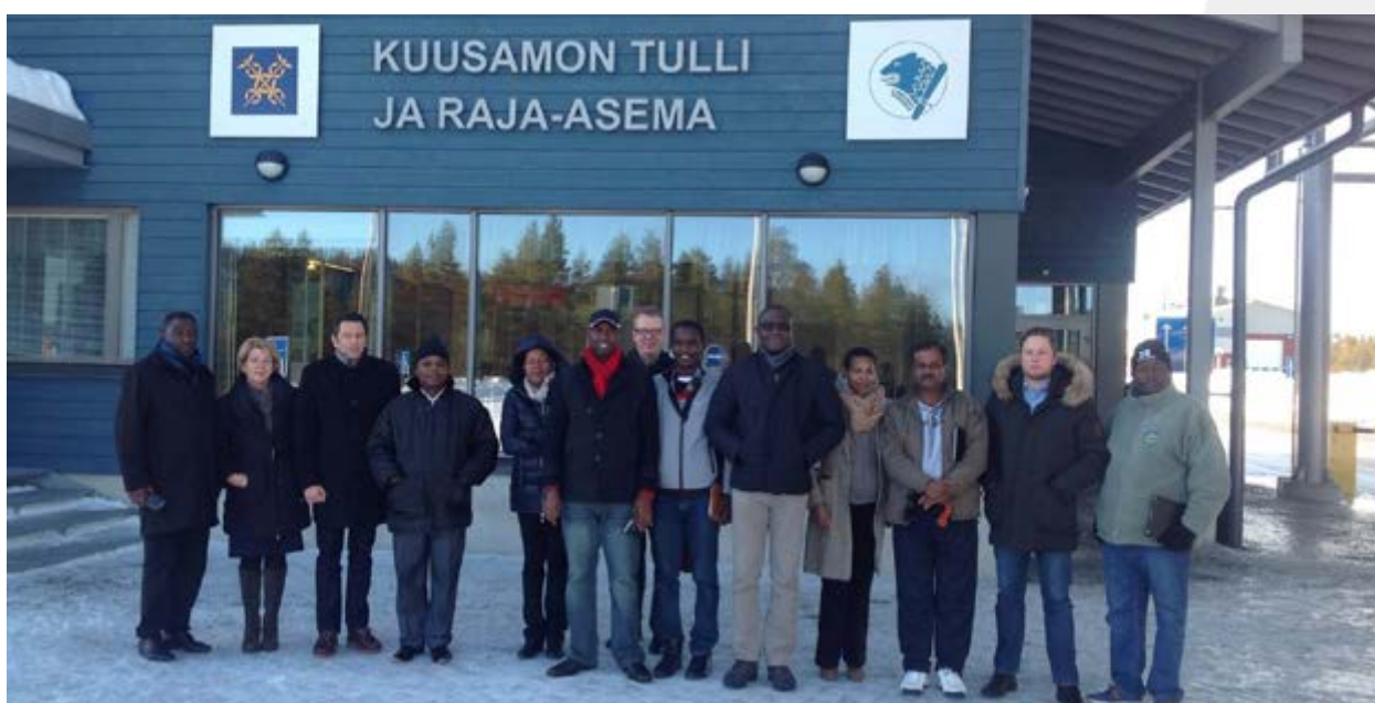
Members of the Steering Committee, WCO ESA Project touring the Finnish – Russian Border Post.

The meeting reviewed progress achieved regarding the implementation of the project. It also discussed a proposed new project by Finland, aiming to progress the trade facilitation (TF) agenda, within the framework of the WCO Mercator Programme in the East and Southern Africa Region.