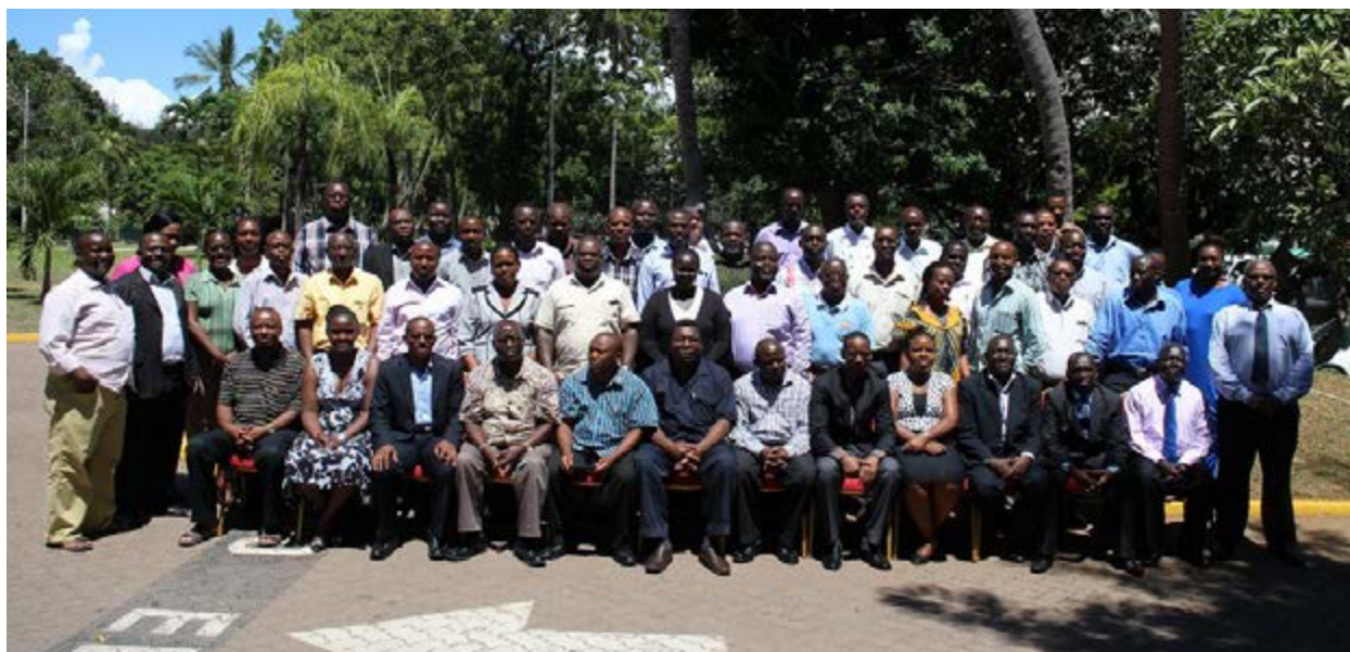
Regional Technical Committee