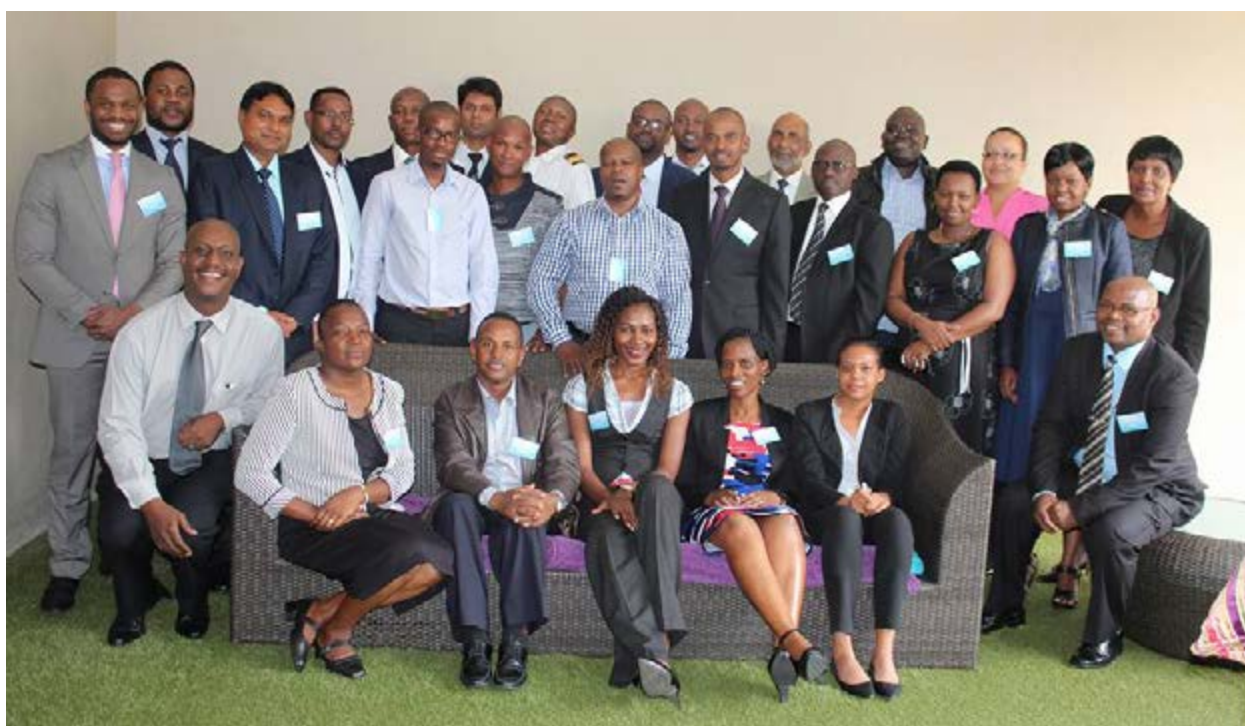
The Training of Trainers (TOT) Workshop - 14 th to 18 th March 2016.